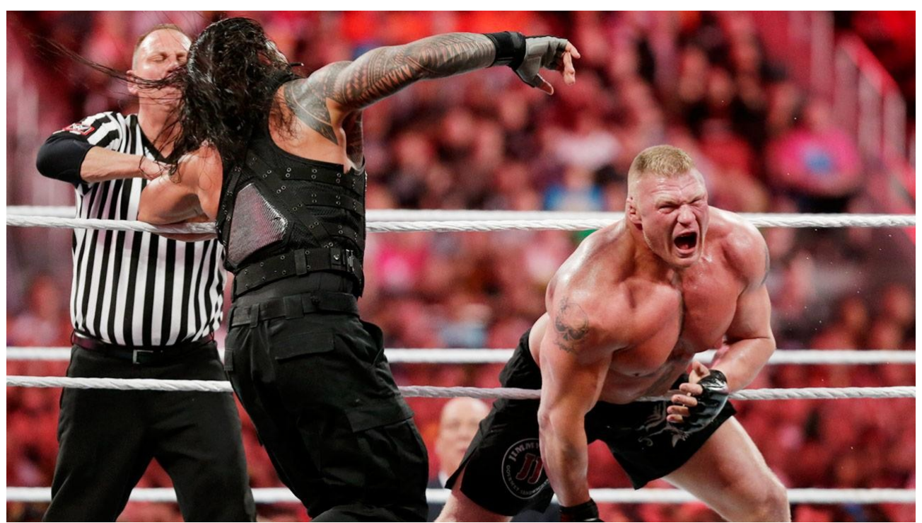
Reigns was caught with a belly to belly suplex and was pulled by the hair back into the ring. Lesnar landed another F5, but Reigns kicked out. Reigns continued to laugh whilst being suplexed to death, which just made Brock angry. Lesnar landed a third F5 for two. Lesnar was sent into the post and

The crowd HATED Roman Reigns to such an extent that they turned the crowd audio down during his entrance. The duo went straight after one another with Brock cutting his check and landing an F5 within the first minute. Lesnar no sold a strike from Reigns and landed a German to the delight of this crowd. Reigns smirked, which sure is the best way to win over a crowd after years of Cena smiles. Lesnar said "Suplex City, b***h" – a phrase that has, as expected, become a catchphrase in its own right. A destruction followed with knees in the ropes and suplex after suplex. Reigns attempted to fight back with a big knee, but was lariated to death on the floor. Lesnar's mouth was busted open too.